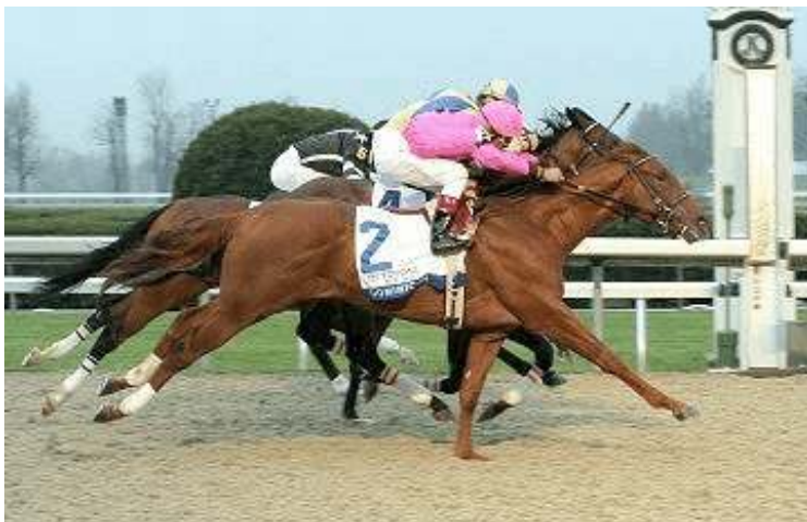
Dominican (#2), et al, in the GI Blue Grass S.

It's going to be fascinating to see how relevant to the Kentucky Derby Saturday's GI Toyota Blue Grass S. proves to be. The desperately slow early pace is most unlikely to be repeated at Churchill Downs and it remains to be seen whether the winner, Dominican, is as good on a conventional dirt course as he clearly is on synthetic surfaces. He was nearly six lengths adrift of Any Given Saturday when the pair filled the minor places behind Tiz Wonderful in the GII Kentucky Jockey Club S. on his last appearance on dirt.