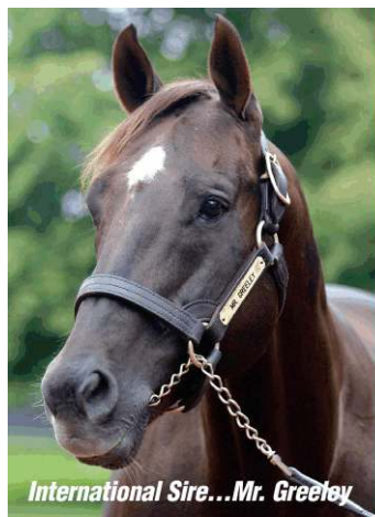
International Sire...Mr. Greeley