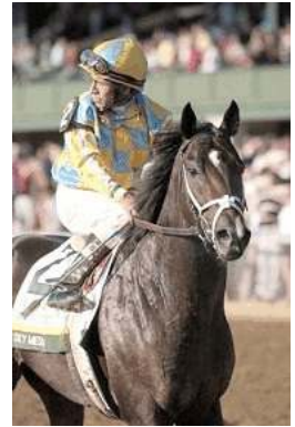
Sky Mesa