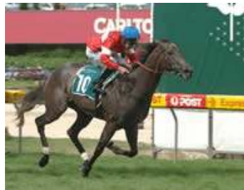
Virage de Fortune globalsprintchallenge.com