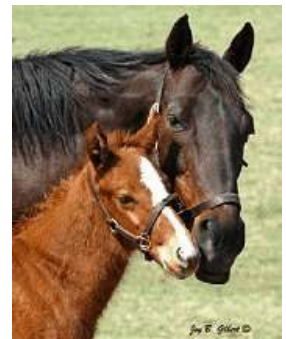
Quanah & her City Zip filly