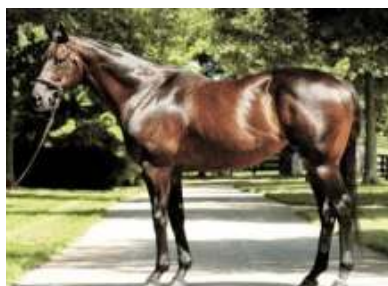
El Corredor

El Corredor has also benefited from the exploits of his dam, the unraced Silvery Swan. His Grade I-winning