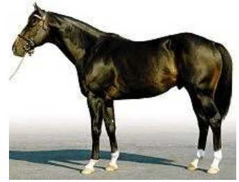
Kafwain

Kafwain, a big son of Cherokee Run originally bought for $720,000 by The Thoroughbred Corp. as a two-year-old, won the GII Norfolk at two and the GII San Vicente at three, placing in the GI Santa Anita Derby at three; so he was a Grade II winner at two and three, and Grade I-placed at two and three. He was very well received by the market, his first yearlings averaging $77,204. Hold That Tiger , by Storm Cat from a top C.V. Whitney family, is a half-brother to GI Belmont S. winner and sire flop Editor's Note, but was a whole lot faster horse himself, winning the G1 Grand Criterium over seven furlongs in France before running third at the Breeders' Cup. He's the crop leader with 147 foals and, though his yearling average wasn't all that high ($55,389), quite a few racy types by him seemed to go through the ring. He and Kafwain, now both at $10,000, look the sort of horses who could be standing for a lot more in a few months' time.