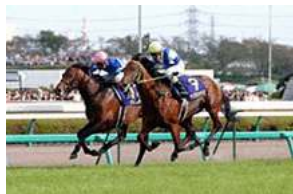
Victory (inside) is his

Victory placed a good second behind previously unbeaten Fusaichi Ho-Oh in the G3-Jpn-Nikkei Hai Nisai S. in the final start of his two-year-old campaign Dec. 23 and resurfaced with a win the Wakaba S.