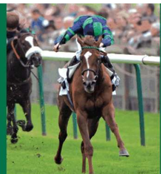
Group 1 winner by Mr. Greeley, FINSCEAL BEO, 2006 European Champion 2YO Filly. Now being pointed to English 1,000 Guineas.

Power. Passion. Performance. 859-293-2676 www.gainesway.com