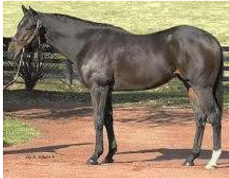
Cactus Ridge Walmac photo

There are lots of horses standing for under $10,000 you can fancy, but one that's caught a lot of pairs of eyes is Walmac's Cactus Ridge , an unbeaten son of Hennessy (son of Storm Cat, sire of Johannesburg) who won all four of his starts at two, including the Gill Arlington-Washington Futurity, but never ran again. He ran a Beyer 101 one day up at Canterbury, but if you discount that (we call that the 'smaller track discount'), he still ran a Beyer 94 winning the J.P. Ellis Juvenile at Ellis Park, and a Beyer 95 winning the Chicago race; those are not far off the fastest of his generation going further later in the year. He's got the right sort of profile--unbeaten two-year-old, never won again--and comes from the right sort of speed sire line (Storm Cat). First yearlings averaged over $53,000.