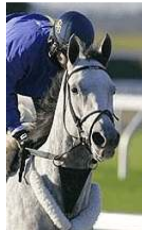
Asi Siempre