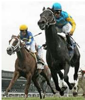
Moudez (Right)