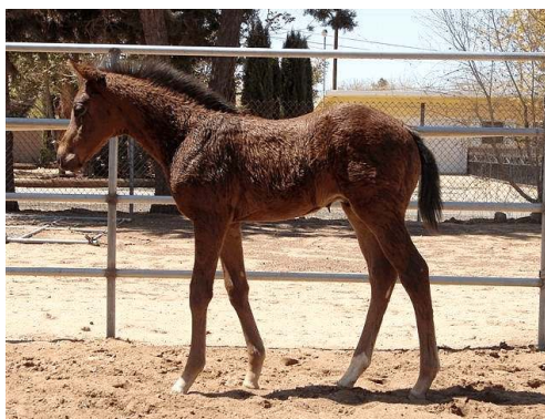
Taste of Paradise - Ethereal Imperial