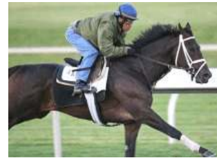
Scat Daddy

A trio of GI Kentucky Derby hopefuls worked for trainer Todd Pletcher at Keeneland Sunday. GII Louisiana Derby winner Circular Quay (Thunder Gulch), partnered by Angel Cordero Jr, worked in company with likely GI Kentucky Oaks favorite Rags to Riches (A.P. Indy). The pair covered five furlongs in 1:00.20, the 11 th fastest of 32 at the distance yesterday. "They make nice workmates and both did very well," said Pletcher. "They were both well in hand throughout, but did enough to get something out