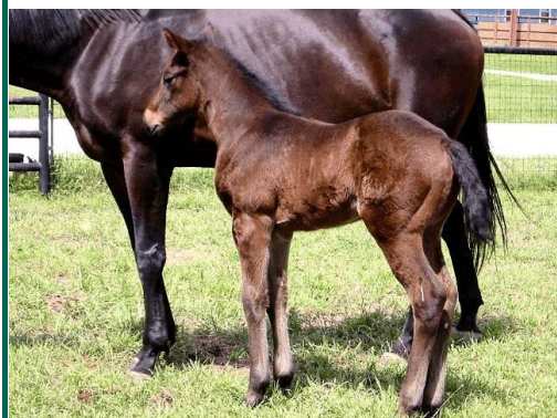
Taste of Paradise - Argentina Avenue