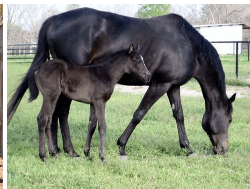
Taste of Paradise - Prom Date