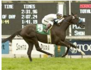
On The Acorn

Offered for $40,000 in a Hollywood claimer last November, On The Acorn (GB) (Inchinor {GB}) made that investment look like a steal when he came from off the pace to take the 1 3/4-mile GII San Juan Capistrano Invitational H. at Santa Anita Sunday. Content to track