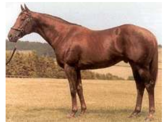
Cadeaux Genereux www.whitsburymanorstud.co.uk

When accomplished stallions reach a certain age their popularity often dips as breeders search relentlessly for something new and potentially even more successful. These stallions' situation can become even more acute when they have popular sons and grandsons standing at lower fees, a good example being the champion European sprinter Cadeaux Genereux.