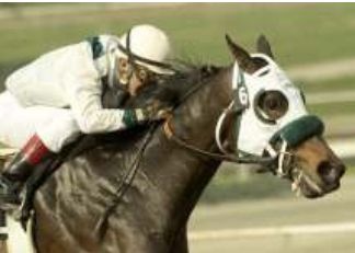
Bob and John

GI Wood Memorial S. winner Bob and John (Seeking the Gold) makes his four-year-old bow in the GIII Texas Mile S. at Lone Star Park today. The dark bay, 17th in the GI Kentucky Derby and eighth in the GI Belmont S., has not been out since finishing second in the El Cajon S. at Del Mar Sept. 2. He has been working steadily for his return, with a mile work in 1:37 2/5 at Santa Anita Apr. 4 and a bullet half in :46 2/5 Apr. 10. He prepped for this with a five-eighths move in 1:01 2/5 at Hollywood Apr. 23. "He's ready," trainer Bob Baffert said. "I thought this would be the logical spot to bring him back because he's been training well and he ships extremely well." Baffert won this race with Preachinattthebar last year. Bob and John, has a record of 12-4-2-3 and earnings of $701,330 to date. Texas Mile Field, p4