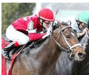
Awesome Hero

Bwana Bull , winner of the Mar. 10 GIII El Camino Real Derby and fifth in the Apr. 7 GI Santa Anita Derby last out, is also under consideration for the first leg of the Triple Crown. The connections of Awesome Hero have no such aspirations. The bay, three-for-five lifetime, comes off a head win in the six-panel Hansel S. at Turfway Mar. 24. He attempted this distance two starts back and, after racing wide on both turns, finished third in the Feb. 26 Mardi Gras S. on the Fair Grounds turf.