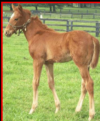
Ch. C. Kela - Front Row Seat