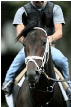
Scat Daddy

Trainer Todd Pletcher sent out four of his GI Kentucky Derby hopefuls yesterday, as well as the likely favorite for the GI Kentucky Oaks, Rags to Riches. At Keeneland, the trio of Any Given Saturday, Circular Quay and Scat Daddy were given their final Derby drills in advance of Saturday's Run for the Roses. First up was Any Given Saturday (Distorted Humor), who, with Angel Cordero Jr. in the irons, breezed an easy five panels in 1:01 1/5 ( video ). The GI Wood Memorial third clocked splits of :24 3/5 and :49 before galloping out in 1:14. "[Cordero] nailed it," Pletcher said afterwards. "I wanted 1:01 today with this horse and he got it--just what I was after following that stiff