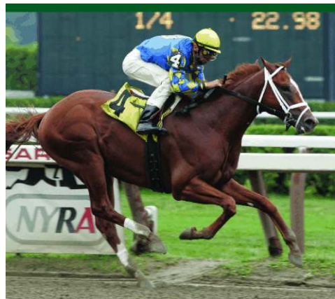
Derby hopeful SAM P. , placed in both Santa Anita Derby-G1 and Lewis Memorial-G2