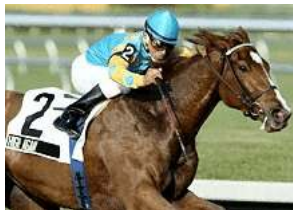
High Again