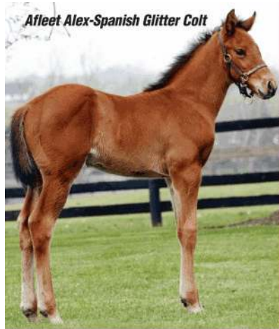
Afleet Alex-Spanish Glitter Colt