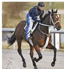
Hard Spun