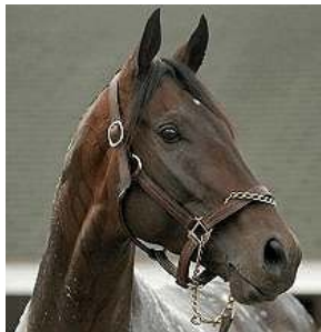
Street Sense