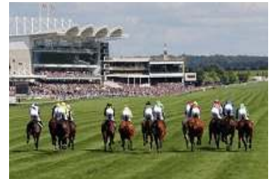
Rowley Mile Newmarket photo