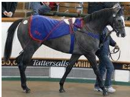
Lot 38 - Clodovil (Ire) filly

Tattersalls' inaugural Guineas Breeze-Up Sale yesterday in Newmarket saw 76 lots sell for 2,129,000gns at an average of 28,0123gns. The median was 23,000gns.