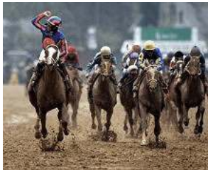
Rags to Riches

Rags to Riches (A.P. Indy) had a much better go of it in her second start beneath the Twin Spires, turning in a championship-caliber performance to win yesterday's GI Kentucky Oaks. The chestnut debuted in a 5 1/2-furlong event in Louisville last June 10 and was off slowly before staying on late to be fourth. The results were markedly different yesterday. Kentucky Oaks cont. p3