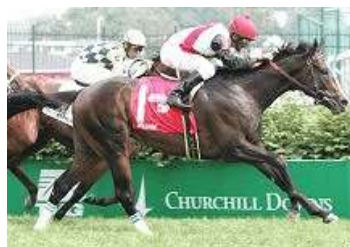
Brilliant

Owned and bred by former U.S. Treasury Secretary James Brady, Brilliant sports a record of four wins from seven starts on the grass and a perfect three-for-three mark over the Matt Winn turf course. A half-length