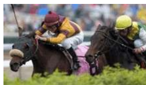
Swingit (outside)

Swingit closed out her juvenile campaign with a neck victory over Audacious Chloe in the Jessamine S. at