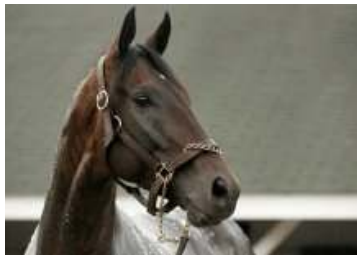
Street Sense