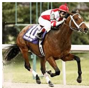
Danzig's son Hard Spun

Or maybe Danzig has been helped by the fact that so many of his descendants are based in Europe. As any dominant stallion's influence spreads through the breed, an increasingly large proportion of the best young broodmares are effectively denied him and his best sons. This could explain why some of Mr. Prospector's most successful sons have struggled to maintain their success rate as they have become older.