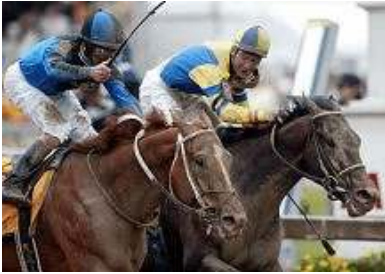
Curlin (outside/left) by a head

The top three finishers from the GI Kentucky Derby completed the trifecta once again in yesterday's