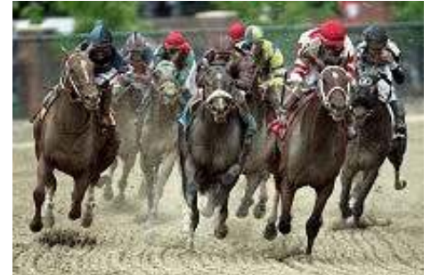
At the top of the stretch

midway up the backstretch. Curlin and Street Sense both began to rally from the back of the pack entering the far turn, and it was the two-year-old champ who threaded the needle beneath Calvin