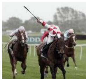
Red Evie

remarked. "She is tough and I knew after two furlongs today I was in business because she was traveling strongly--I probably got there too soon, as she was pulling herself up a bit towards the end."