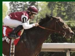
By A.P. INDY SAHARA HEAT 1ST MARINE S.-G3 Lane's End Sales Grad