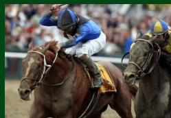
By SMART STRIKE CURLIN 1ST PREAKNESS S.-G1