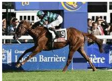
Finsceal Beo (Ire)