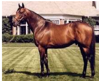
Smart Strike

Twentysomethings Pleasant Tap and Silver Deputy occupy sixth and seventh spots, but 13 of the next 14 places are filled by relatively younger sires, all of whose first foals were born in 1997 or later; the exception is Danzig, not surprisingly currently ranked 19th, considering the quality of his 2007 three-year-olds. The F1997 (first foals 1997) sire crop is represented by Mr. Greeley (eighth) and Thunder Gulch (17). Smart Strike's F1998 contemporaries Maria's Mon (14) and Unbridled's Song (18) join him among the current General Sire List's top 20. Among F1999 sires, the perennial crop leaders