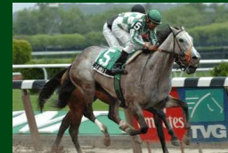
By A.P. INDY TEAMMATE 1ST SHUVEE H.-G2