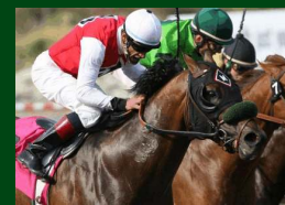
By STEPHEN GOT EVEN TIME TO GET EVEN 1ST LAZARO BARRERA MEMORIAL S.-G3 Lane's End Sales Grad