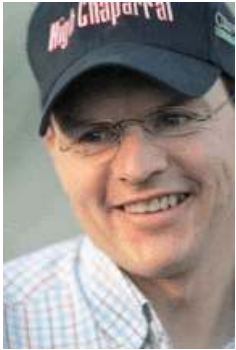
Aidan O'Brien Horsephotos