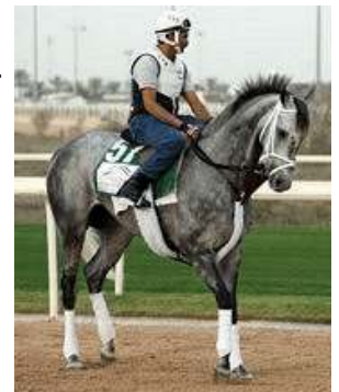
Honey Ryder

MGISW Honey Ryder (Lasting Approval), who was unsuccessful in her bid to beat the boys in the Mar. 31 G1 Dubai Sheema Classic, makes her first start since that overseas trek in the GII Sheepshead Bay H. at Belmont Park tomorrow. The six-year-old mare captured four of seven starts last season, including a nose decision in the Oct. 7 G1 Flower Bowl Invitational H. She capped the year with a third-place finish in the G1 Breeders' Cup F/M Turf, and was beaten just a neck when second in her 2007 opener, the Feb. 24 G1 Gulfstream Park BC H. Connections opted to take on colts again at Nad al Sheba, but the gray mare failed to fire, finishing 11th behind Vengeance of Rain (NZ). "She never really got on track last time," trainer Todd Pletcher explained, adding, "She's trained very well since coming back." Field, p4