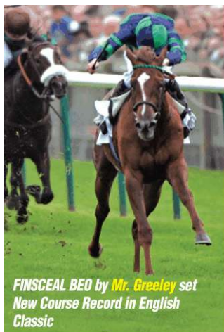
FINSCEAL BEO by Mr. Greeley set New Course Record in English Classic