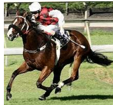
Takeover Target

The seven-year-old ran second last out in the G1 BTC Cup over this course May 12. The likely favorite will be the swift Gold Edition , who is bidding to become the first three-year-old filly to capture this historic contest. In spite of their age difference, Gold Edition has more career starts--27--than her veteran rival (25).