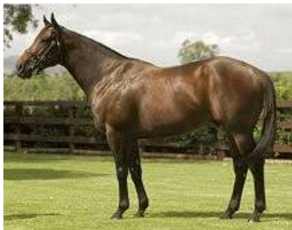
Fastnet Rock www.coolmore.com

FASTNET ROCK COLT TOPS MM DAY 2 With only a few lots left to go through the ring at Thursday's second session of the Magic Millions National Weanling Sale in Bundall, Queensland, a handsome colt from the first crop of champion Fastnet Rock (Aus) (Danehill)