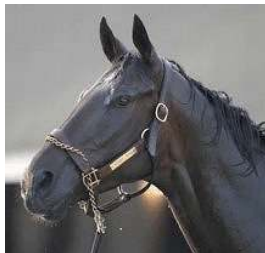
Street Sense