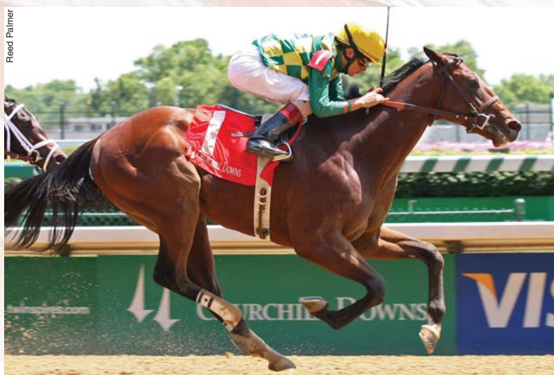
Highly-regarded 2YO DR. NICK - :58.43 at Churchill