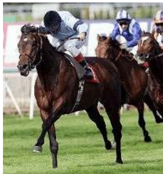
Regime at Sandown