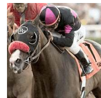
Lava Man