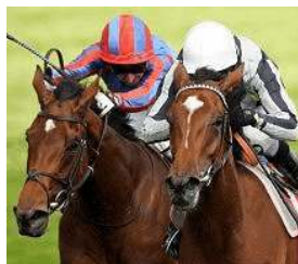
Light Shift (right)

Henry Cecil was back in Epsom's hallowed winner's circle yesterday after the Niarchos Family's Light Shift (Kingmambo) delivered a record-equaling eighth success in the G1 Vodafone Oaks for the trainer. Rated the lesser of the Warren Place duo by the betting public, the 13-2 shot raced into the limelight inside the final quarter and refused to be denied in a pulsating battle with Peeping Fawn (Danehill) to score by a half length. "It's a fairytale--a dream,"