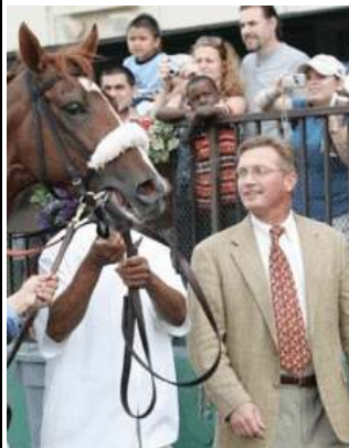
Corinthian & Little Horsephotos