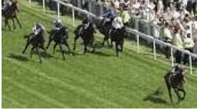
Authorized stretches away to win impressively