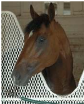
Hard Spun