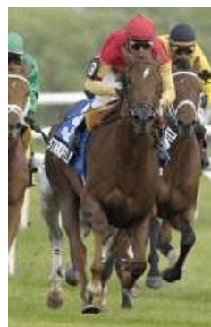
Strike Softly

Click for the brisnet.com chart or the free brisnet.com catalogue-style pedigree . Video, sponsored by Taylor Made.