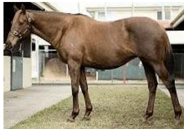
Gypsy Dancer magicmillions.com.au

Last week, Gypsy Dancer (NZ) (Dance Floor--Racy Belle {NZ}, by Straight Strike) made headlines when her weanling colt by Redoute's Choice (Aus) set an