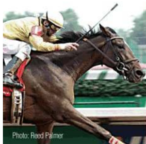
Lady Joanne by Orientate winning the Dogwood Breeders' Cup S.-G3 on 6-2 at Churchill