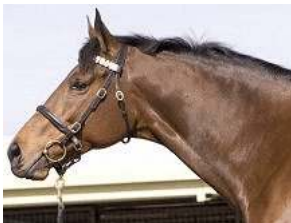
Private Steer