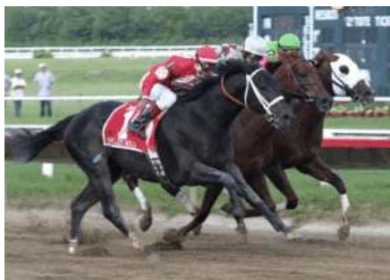
Offlee Wild (outside) defeats Funny Cide and The Lady's Groom in the 2004 MassCap

Suffolk Downs' Massachusetts H., which hasn't been contested since 2004 due to the financial woes of the East Boston track, returns to the race calendar this year and will be run on Saturday, Sept. 22. Last held as a