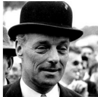
Baron Guy de Rothschild (1909-2007)

Baron Guy Edouard Alphonse Paul de Rothschild, one of France's premier breeders and owners, died Tuesday. He was 97. The French banker carried on the rich tradition of the de Rothschild family in business and in the sport his father Edouard had patronised with his Haras de Meautry operation in Normandy. Guy de Rothschild's most famous runner was Exbury (Fr), who went unbeaten through his 1963 season via the Prix Ganay, Coronation Cup, and Grand Prix de Saint-Cloud before punctuating the campaign with victory in the Prix de l'Arc de Triomphe. Other notable successes came with Crystal Palace (Fr) in the 1977 Prix