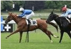
Stage Gift