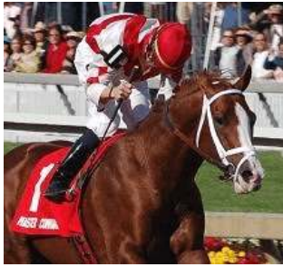
Master Command Sherackatthetrack