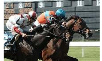
Strike a Deal (inside) and Summer Doldrums at Belmont

most accomplished grass runner of his crop. A field of 13 sophomores will be hoping to follow in his hoofprints in today's $750,000 affair, including Strike a Deal (Smart Strike) and Summer Doldrums (Street Cry {Ire}), who finished noses apart in Belmont's Straight Deal S. going a mile May 23 ( video ); both colts are bred to