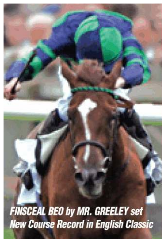
FINSCEAL BEO by MR. GREELEY set New Course Record in English Classic