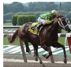
Take D'Tour