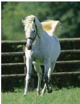
Kendor (1986-2007)