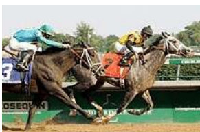
Flashy Bull

Flashy Bull had only a maiden win under his belt, but posted a second-place finish behind Bluegrass Cat in the GII Remsen S. as a juvenile, and third-place finishes in the GII Fountain of Youth S.-- he was moved up to second following the DQ of Corinthian from first--and the GII Ohio Derby. Given the rest of the season off following a well-beaten seventh in the GI Haskell Invitational H. in August, Flashy Bull resurfaced with a second-place finish in a Gulfstream allowance Jan. 26.