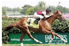
Quite a Bride

Click for the brisnet.com chart . Video, sponsored by Taylor Made.