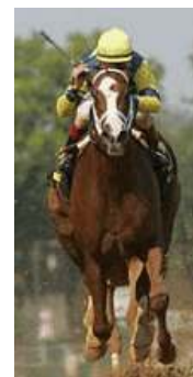
Indian Vale Horsephotos

Click for the brisnet.com chart or the free brisnet.com catalogue-style pedigree . Video, sponsored by Taylor Made.