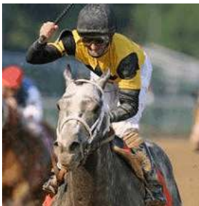
Flashy Bull