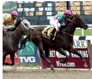
Indian Flare

Indian Flare (Cherokee Run) showed her determination and versatility to hold off classy challenger Oprah Winney (Royal Academy) in the GII Vagrancy H. at Belmont Park Sunday. Installed the lukewarm 5-2 favorite