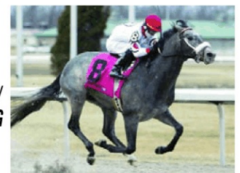
2007 3yo SW CATMAN RUNNING