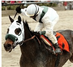
Bob and John