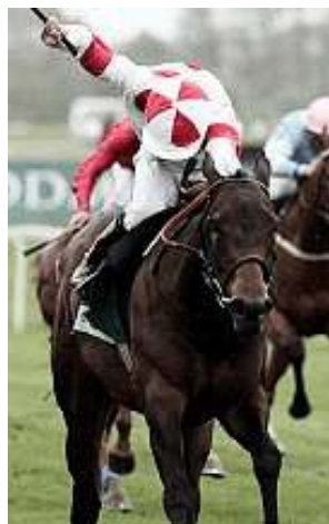
Red Evie