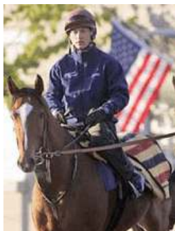
George Washington

Few comebacks have seemed as unlikely and been as anticipated as that of George Washington (Ire) (Danehill), but he steps onto the Ascot turf as large as