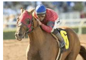
Molengao