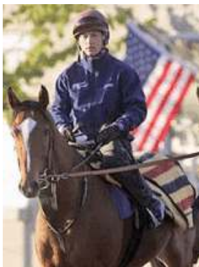
George Washington