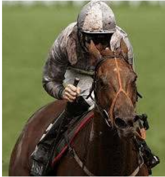
Indian Ink