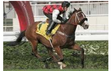
Takeover Target