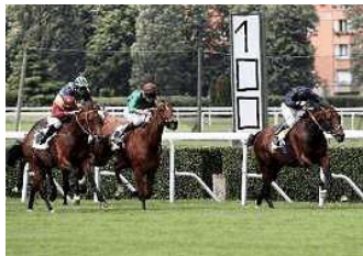
Mountain High (right)