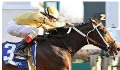
Tiz Wonderful Reed Palmer

After three easy works since returning from injury, Stonestreet Stable's unbeaten Tiz Wonderful (Tiznow) was asked for a bit more yesterday morning. Breezing five furlongs over the main track at Churchill Downs, the three-year-old colt stopped the clock in 1:01 3/5,