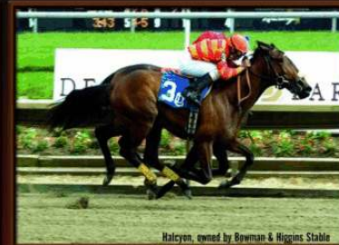
Malcon, owned by Bowman & Higgins Stable