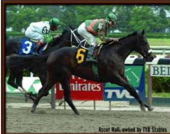
Ascot Hall, owned by TYB Stables