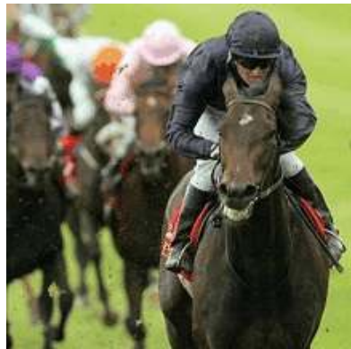
Soldier of Fortune