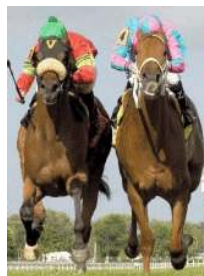
Always First (left)