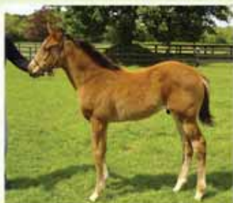
COLT EX LADY SCARLETT