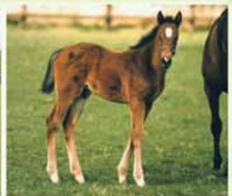
COLT EX SECRET WELLS