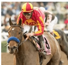
Pussycat Doll Benoit photos

Pussycat Doll , winner of last year's GI La Brea at Santa Anita, closed out the 2006 season with a victory in the GI Humana Distaff H. at Churchill Downs last May. Kicking off her current campaign the same way, the bay came home an easy four-length winner in the seven-furlong GI Santa Monica H. Jan. 28 before finishing second behind Hysterical Lady in her latest start in this year's edition of the Humana Distaff May 5.