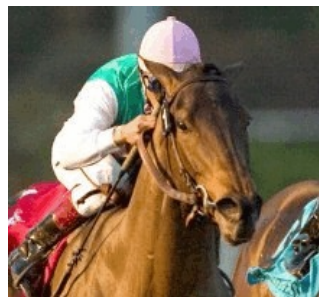
Price Tag (GB)

Even with the defection of champion three-year-old filly Wait a While from tonight's GII CashCall Mile Invitational S. at Hollywood Park, the $1-million race looks to