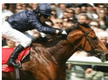
George Washington (Ire)