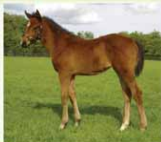
FILLY EX SACHET