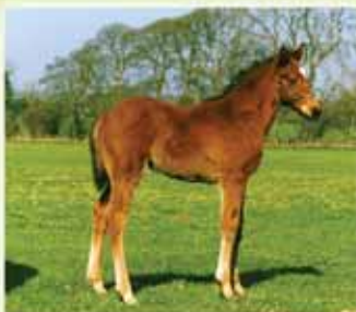
COLT EX CHALICE WELLS