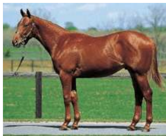
Yesterday's record topper