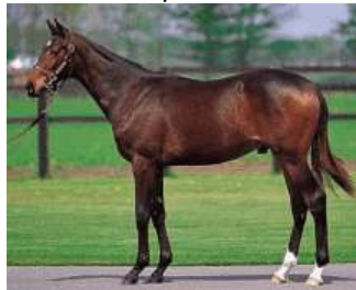
Hip 52 www.jrha.or.jp