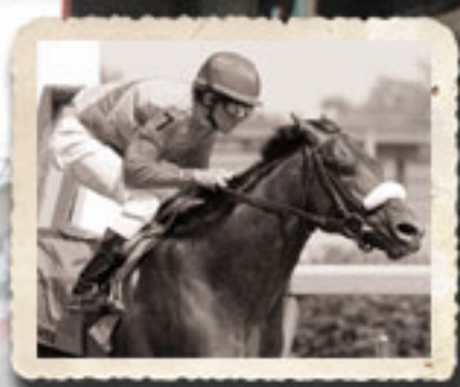
CHELOKEE Winner of the Grade 3 Northern Dancer Breeders' Cup Stakes