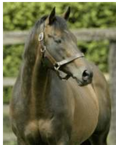
Rainbow Quest Juddmonte

Leading European sire Rainbow Quest (Blushing Groom {Fr}--I Will Follow, by *Herbager) died Saturday after suffering complications from emergency colic surgery. The 26-year-old stallion had been standing at Banstead Manor Stud for the last 19 years after beginning his stud career at Juddmonte Farms, Wargrave. Rainbow Quest was purchased by Juddmonte as a yearling of 1982 for $950,000 at the Fasig-Tipton Kentucky July sale. He quickly justified that price tag, finishing second behind El Gran Senor in the G1 Dewhurst S. as a two-year-old. As a three-year-old, he won the G2 Voltigeur S. and finished second in the G1 Irish Derby and G3 Craven S. and third in the G1 Prix du Jockey Club. He had even more success at four, winning the G1 Prix de l'Arc de Triomphe via the disqualification of Sagace, and the G1 Coronation Cup. He was also second in the G1 Coral-Eclipse S. and third in the G1 King George and Queen Elizabeth Diamond S. en route to championship honors as the top older horse in England and France.