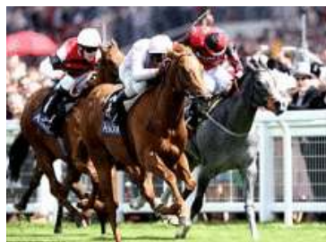
Dutch Art