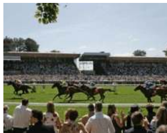
Newmarket Racecourse