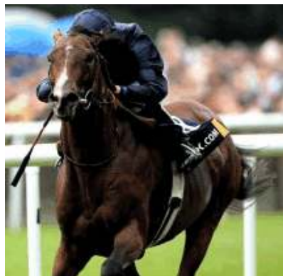
Papal Bull