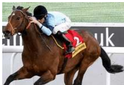
Asset (Ire) www.sportinglife.com