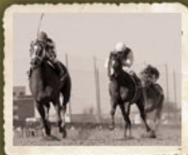
Winner of the Grade 1 Carter Handicap