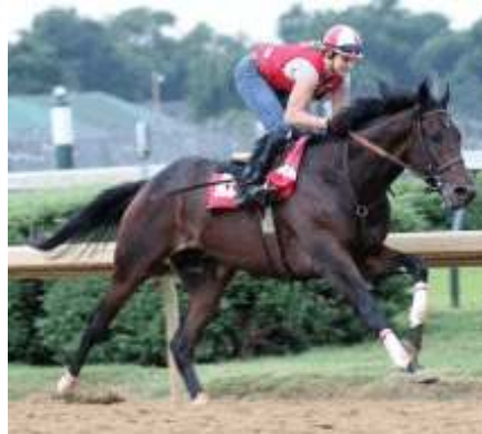
Street Sense Reed Palmer

STREET SENSE BREEZES AT CHURCHILL GI Kentucky Derby winner Street Sense (Street Cry {Ire}) continued to progress towards a return to the races yesterday, breezing five furlongs in a steady 1:02.20 at Churchill Downs. The work, the 10 th fastest of 27