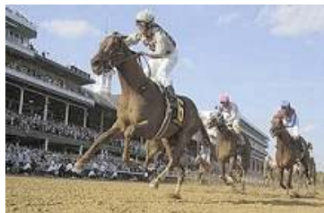
Funny Cide

FUNNY CIDE RETIRED Funny Cide (Distorted Humor--Belle's Good Cide, by Slewacide), the "gutsy gelding" who in 2003 became the first gelding to win the GI Kentucky Derby in nearly three-quarters of a century, has been retired from racing, the Blood-Horse reports. Bred in New York by WinStar Farm, Funny Cide was perfect in a trio of starts at two, including a pair of restricted stakes victories. Though winless in his first