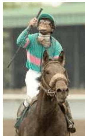
Tiago