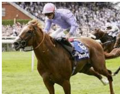
Sakhee's Secret