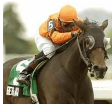
Bear Now

Four-for-six over the synthetic main track at Woodbine, Bear Stables Ltd's Bear Now (Tiznow) looks to retain her perfect record going two turns in this afternoon's $500,000 GII Delaware Oaks. Third in the