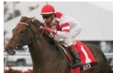
Silver Tree

Seven-year-old Silver Tree opened the season with a win in the Mar. 4 GIII Appleton H. at Gulfstream. Off the board against graded foes in his next two starts, he rebounded with an optional-claiming score at Belmont June 20. The millionaire drops back off that 10-panel affair. Ballast , winner of the Dec. 2 GIII Tropical Turf H. at Calder, went to the bench after a sixth in the Jan. 6 Ft. Lauderdale S. at Gulfstream. He returned to be second in an allowance test over course and distance June 2.