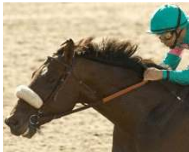
Tiago