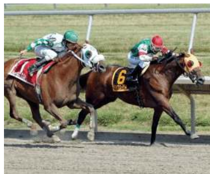
Moon Catcher (#6) digs in

Hustled up to set the pace, Moon Catcher raced a bit wide into the turn before securing the rail in advance of Bear Now and Cotton Blossom, who was favored off