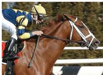
Indian Vale A Coglianese

Asi Siempre and Indian Vale renew their budding rivalry in today's lucrative $1-million GII Delaware H. The presence of the talented pair did little to scare off