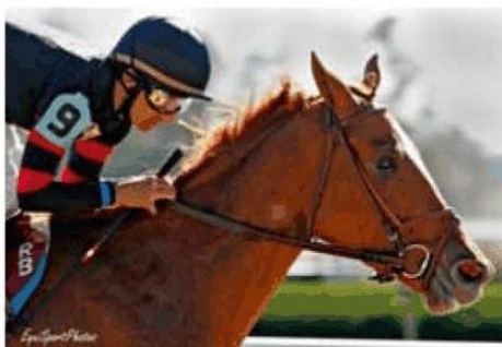
New 2007 Graded stakes winner GINGER PUNCH