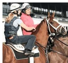
the veterinarian check her over [today]

GI Belmont S. winner Rags to Riches (A.P. Indy) was pulled up shortly after starting a scheduled five-furlong work at Belmont Park yesterday when exercise rider