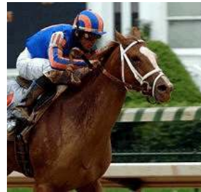
Rags to Riches