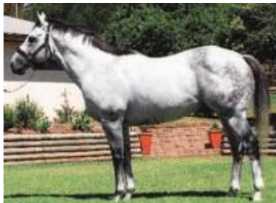
Lion Hunter stallions.com.au

LION HUNTER SETS RECORD The late Oaklands Stud sire Lion Hunter (Aus) (Danehill--Pure of Heart {Ire}, by Godswalk) broke the world record for the