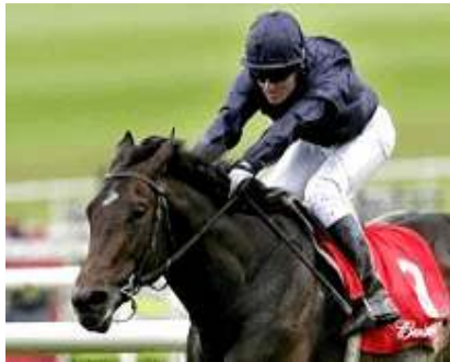
Soldier of Fortune