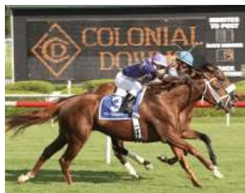
Red Giant (outside)

On the topic of two-year-olds, it is worth pointing out that his current crop was sired in 2004 in his third season in the USA, and his fourth in all. His fee that