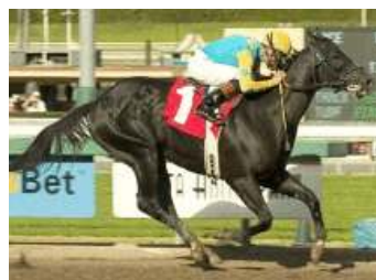
E Z Warrior

E Z WARRIOR RETURNS AT DEL MAR Zayat Stables LLC's E Z Warrior (Exploit), undefeated in his three racetrack appearances to date, is set to make his return to action in Sunday's GI Bing Crosby H. over Del Mar's synthetic surface. Trained by Bob Baffert, the