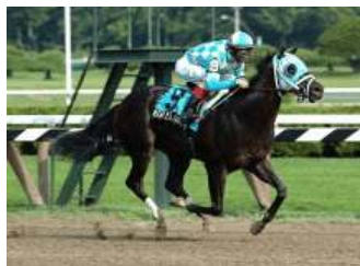
Ready's Image