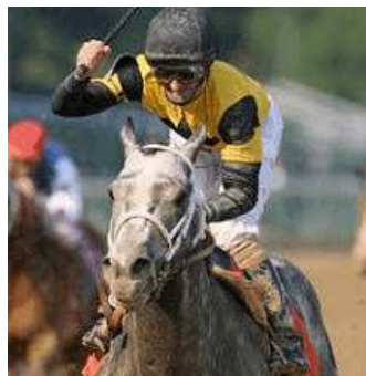
Flashy Bull