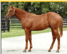
#123 Half-brother to a SW, 30 stakes horses under 1st 3 dams