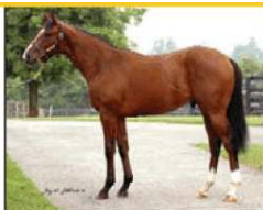
#49 Colt out of a Stakes-producing sister to VALID EXPECTATIONS

Claiborne (859) 233-4252 www.claibornefarm.com