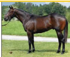
#186 Half-brother to a SW out of a Graded Stakes performer