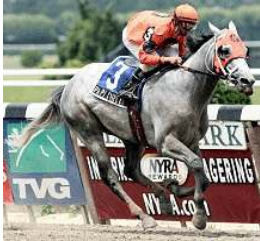
Papi Chullo