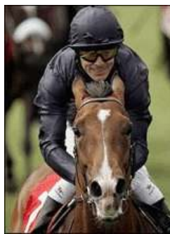
Dylan Thomas