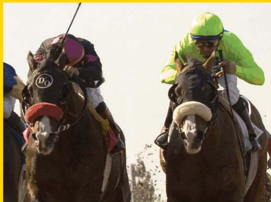
Lava Man and A. P. Xcellent

A. P. Xcellent gave the great Lava Man all he could handle in the Hollywood Gold Cup-G I.