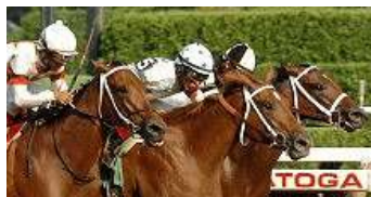
Subtle Aly (center)