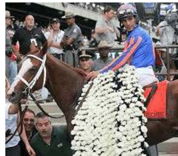
Rags to Riches