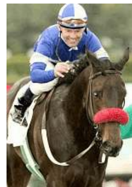
Super Freaky

Super Freaky , winner of the Mar. 4 La Habra S. and the Apr. 7 GIII Providencia S. at Santa Anita, had to settle for second behind Valbenny (Ire) in the May 12 GIII Seniorita S. and June 9 GII Honeymoon BC S. at Hollywood. That rival went on to run second in the GI American Oaks, and skips this test. Passified bested Super Freaky in an optional claimer at Santa Anita in January. Second in the Providencia, third in the Seniorita and fourth in the Honeymoon, she outfinished Diva's Seastar and Spenditallbaby to take the July 6 Flawlessly S. Spenditallbaby switched to the all-weather for Del Mar's Fleet Treat S. July 22 and bested fellow Cal-breds in a three-way photo. Undefeated La Tee stretches out and makes her stakes bow after taking a Hollywood allowance going 6 1/2 furlongs June 2.