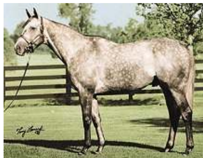
Silver Charm

stud were undoubtedly Silver Charm's wins in the 1997 GI Kentucky Derby and GI Preakness S. en route to three-year-old championship honors. A quarter-century after his Whitney victory, and now 29, Silver Buck is