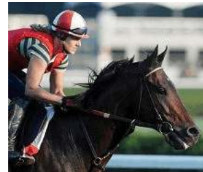
Street Sense