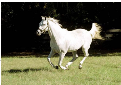
Silver Buck in 2007

The 2007 renewal of the the GI Whitney H. marks the 25th anniversary of Silver Buck's victory in the 1982 event. Fresh off his track record setting performance in the GI Suburban H. at Belmont eight weeks earlier, Silver Buck was made the 4-5 favorite in the Whitney and didn't disappoint, scoring a 1 1/2-length victory over Winters Tale. It would be the last win of his career.