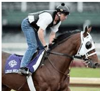
Lewis Michael

Second in the GII Peter Pan S. and third in the GIII Perryville S. at three, Lewis Michael capped off the campaign with an 11th-place finish in the GI Breeders' Cup Sprint, but has been first or second in all four starts this term. The bay followed an allowance victory on the grass at Gulfstream in March with runner-up finishes on all-weather strips in the Apr. 14 GII Commonwealth BC S. at Keeneland and the May 26 GIII Hanshin H. at Arlington. The 1-5 chalk in an Arlington allowance July 15, he cruised to a seven-length score. A.P. Arrow was third in the Feb. 3 GI Donn H. and Mar. 3 GII Gulfstream Park H. before posting a head success in the Mar. 31 GIII Skip Away H. Third again in the June 9 Birdstone S. at Belmont, he comes off a sixth behind Lava Man in the June 30 GI Hollywood Gold Cup. Minister's Joy has been second in both all-weather tries, including a rallying nose defeat in the Apr. 26 GIII Ben Ali S. at Keeneland. A close-up third in an optional claimer on the turf at Belmont May 25, the five-year-old was most recently sixth in the June 9 GI Manhattan H.