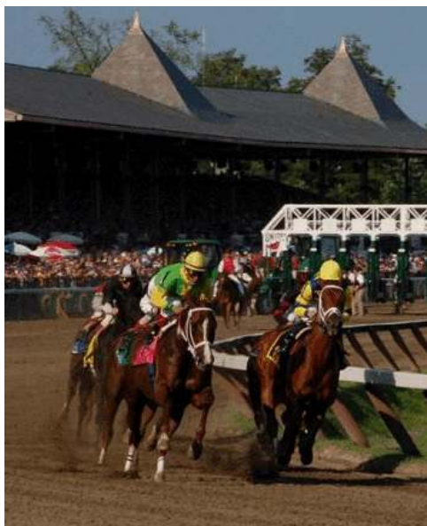
Pool Land leads the field on the clubhouse turn in the 2006 GI Go For Wand S.

GII Vinery Madison S. Apr. 11, then added a Churchill allowance May 5. She finished second, beaten a neck, in the GI Ogden Phipps H. June 16. Cutting back to seven furlongs for the GII First Flight H. July 8, she rolled to a five-length victory. "I think she can do anything," trainer Bobby Frankel said. "But I think she may have distance limitations. But I still think she is the best horse