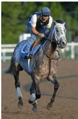
Flashy Bull