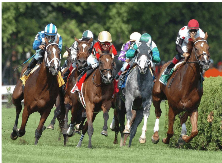
TDN Photo of the Day - My Typhoon leads the Diana field