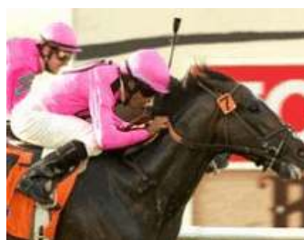
Becrux

After taking this race last year, Becrux went on to post a career-best effort in the GI Woodbine Mile in September, where he beat Rebel Rebel (Ire) and Ad Valorem. He failed to hit the board in his next four, but ran with credit to be fourth, beaten a length, in The Tin Man's GI Shoemaker BC Mile May 28, as well as the GII American Invitational H. at Hollywood June 30. Returning to Del Mar, where he was two-for-three coming into this, Becrux sat in fifth as Lang Field set :22 1/5 and