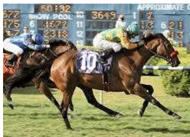
Mystery Giver