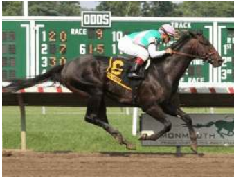
First Defence

First Defence (Unbridled's Song), an impressive winner of Monmouth Park's Long Branch Breeders' Cup S. July 14, will make his next start in the GI King's Bishop S. Aug. 25, according to Daily Racing Form . The Long Branch has been a traditional prep for Monmouth's GI Haskell Invitational, but trainer Bobby Frankel preferred to cut his charge back in distance for the seven-furlong King's Bishop. "I think a mile and an eighth is too far for him," Frankel told DRF . "I