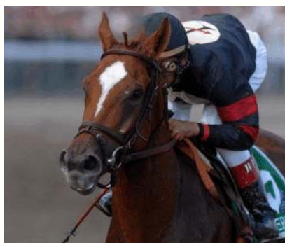
Click here for video of the 6-length win Click here for race chart