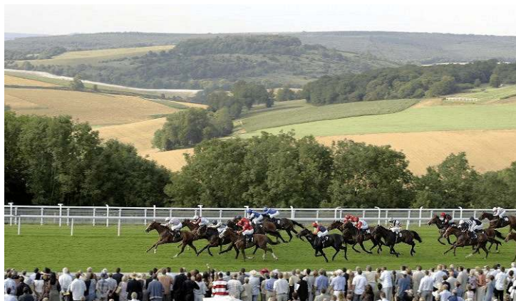
Glorious Goodwood Action Plus

Among the many 'younger' stallions with just a few AW runners as broodmare sires, early returns look good for In Excess (2.02, two stakes winners from 22 runners), Boundary (3.44), and Cherokee Run (2.25), to name just three. For those of you about to embark on buying and selling at the yearling sales, the click-through alphabetical tables from last week (AW sires) and this week (AW damsires) should make interesting reading. Yes, it is very early days; yes, it is inconclusive. Still, AW racing is the wave of the future in North America (the inevitable teething problems included), so it could just be well worth knowing how sires and damsires whose stock you'll be seeing at the sales have been doing in the AW racing sphere thus far.