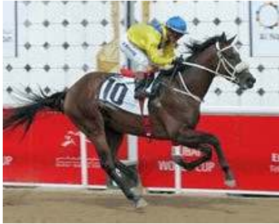
Asiatic Boy at Nad al Sheba