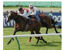
Authorized at Work