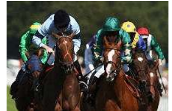
Tariq (blaze)