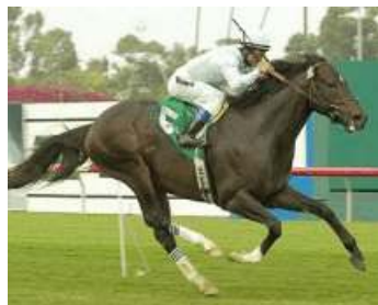
After Market