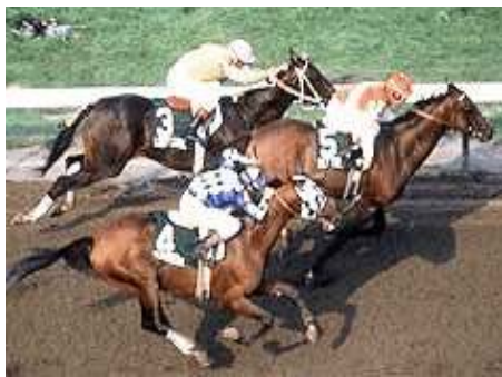
Bet Twice (5), Alysheba (4), Lost Code (3)

On the eve of the 20 th anniversary of the 1987 GI Haskell Invitational S., Monmouth Park officials can only hope that this year's renewal, which includes GI Preakness S. winner Curlin and GI Kentucky Derby runner-up Hard Spun, can rival that legendary edition of the race. Heading into the 1987 Haskell, there was tremendous buzz surrounding the