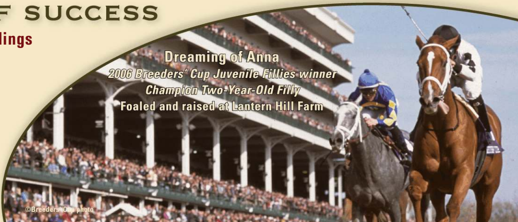
Dreaming of Anna 2006 Breeders' Cup Juvenile Fillies winner Champion Two-Year-Old Filly Foaled and raised at Lantern Hill Farm