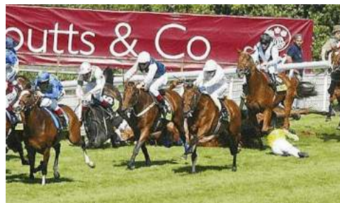
Goodwood Spill - No Serious Injuries

In a race marred by a dramatic spill in the final quarter mile, Third Set emerged several steps ahead of the handicapper when recording his second high-profile success in the space of six days. The bay has not looked back since his unplaced effort in the Buckingham Palace S. at Royal Ascot June 22, winning a competitive Newmarket handicap July 11 before an impressive success from the bottom of the weights last Saturday in the Totesport International S. back at Ascot. Sneaking in again at the foot of the list here, he made a mockery of his current mark, traveling easily in behind the leaders hard against the rail before arriving