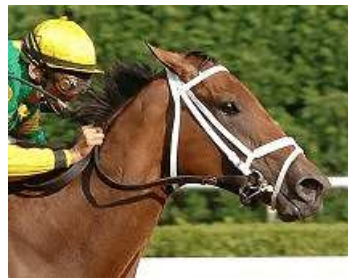
Cotton Blossom