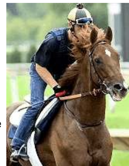
Dr Dino