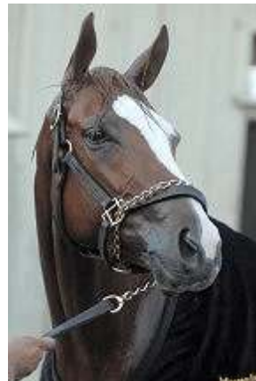
Rags to Riches

Rags to Riches has been given a clean bill of health after her visit to the New Bolton Center and looked back on track during an easy breeze on the Saratoga main track Sunday, but her conditioner is now leaning toward giving her just one start before the Oct. 27 GI Breeders' Cup Distaff. "It makes the most sense," Pletcher told DRF , adding, "If she runs in the Alabama, it is too far out [from the Breeders' Cup]; she's going to need to run again." The GI Kentucky Oaks and GI Belmont S. winner could prep for the Breeders' Cup in the Sept. 8 GI Ruffian S. or the Sept. 15 GI Gazelle H. "If I waited for something like the Ruffian or Gazelle, it would be nice spacing from that to the Breeders' Cup, so we're in good position option-wise." The chestnut will work again Sunday, after which Pletcher will make a final decision regarding the Alabama. Stablemate Octave (Unbridled's Song) will make her next start in the nine-furlong test. Runner-up in the Kentucky Oaks, the gray comes off back-to-back wins in the June 30 GI Mother Goose S. and July 21 GI Coaching Club American Oaks.