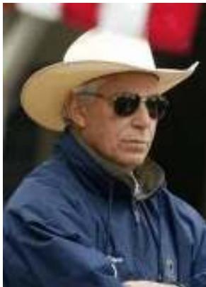
D W Lukas