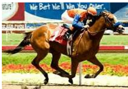
Tasha's Miracle