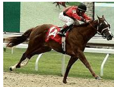
One Hot Wish

One Hot Wish makes her first appearance since setting a world record for 4 1/2 furlongs in a Keeneland maiden test against colts Apr. 12. The chestnut, who hit the wire 12 1/4 lengths in front of subsequent Tyro S. winner Lantana Mob, stopped the timer in :48.87 that afternoon.