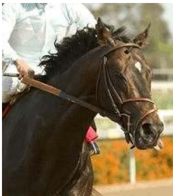
After Market