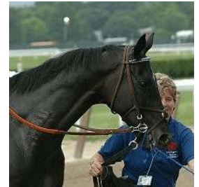
Better Talk Now