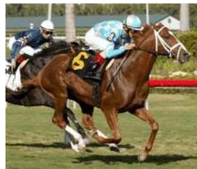
English Channel