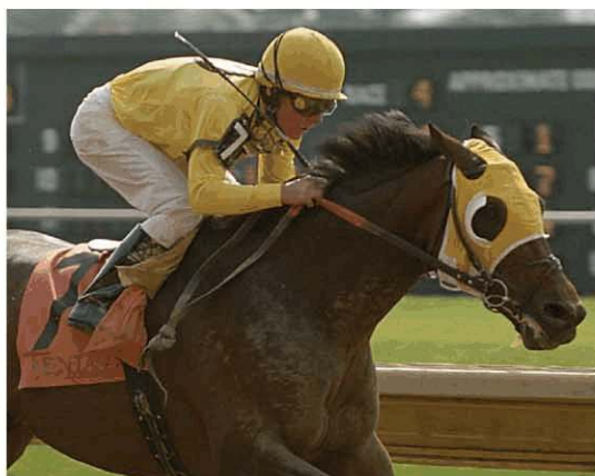
M B SEA ($699,771), SW Aug. 4