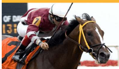
MR. HARRY goes wire-to-wire in 4 1/2-length Arlington MSW score.