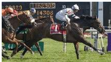
Four Footed Fotos

Also Ran: Sunriver, Stream Cat, Danak (Ire), Pressing (Ire). Scratched: After Market.