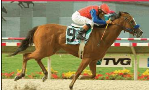
Back-to-back wins for Barretts March: Tasha's Miracle ($325,000 RNA) wins Sorrento S.-G3 following the lead of 2006 victress Untouched Talent.

Barretts 2-year-old Sale Grads win Big on Both!