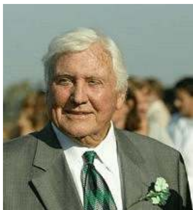
Merv Griffin 1926 - 2007

Entertainment icon and prominent horse owner Merv Griffin died Sunday morning of prostate cancer. He was 82. Griffin had successfully battled the disease for the