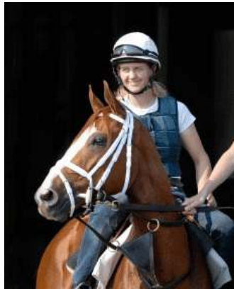
Rags to Riches last month