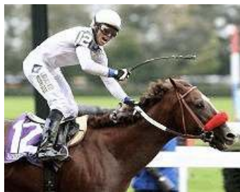
Griffin's champion Stevie Wonderboy