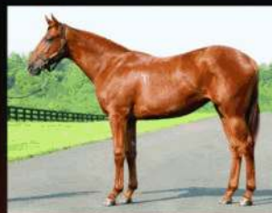
Filly o/o Yankee Tradition Owner: Earl Silver