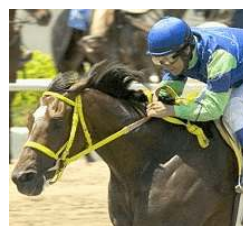
Arson Squad