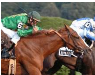
Lady Attack

win here. A three-length winner in her grass debut at Churchill in early June, Lady Attack romped by 5 1/2 lengths in a one-mile allowance in her next June 23. Shipped north for the Saratoga meet, she gave herself plenty to do when she broke near the back of the pack in the 11-horse strong GIII Lake George S. July 27, but closed with a rush in the lane to be beaten just a