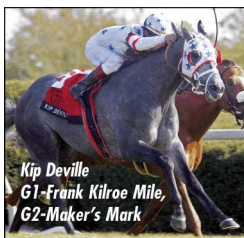
Kip Deville G1-Frank Kilroe Mile, G2-Maker's Mark

Texas Summer Yearlings 10 a.m. • August 27-28 Lone Star Park • Grand Prairie, Texas