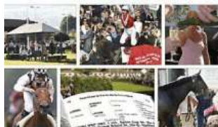
Vente de Yearlings du 17 au 20 Août à Deauville

Arqana's inception last year coincided with a reversal of the fortunes of France's flagship Deauville August Yearling Sale, and the latest edition will bid to build on the increases of 12 months ago as the first of four sessions begin today. While the management of the new conglomerate are keen to praise the work Agence Francaise had already done to arrest this auction's period of relative decline, the coming together of that organisation and Goffs