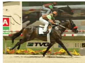
Lava Man on the Poly

Defending champion Lava Man (Slew City Slew) has drawn the rail post for Sunday's GI Pacific Classic S. at Del Mar. The gritty six-year-old was installed as the