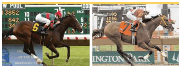
MSW winners Monmouth, Arlington, etc.