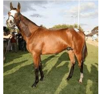
Friday's Deauville Topper - Hip 108