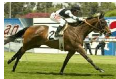
Valbenny Benoit Photo

All horses in the TDN are bred in North America, unless otherwise indicated