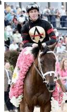
Spun Sugar

The 11th annual Adena Springs Broodmare Sale at Fasig-Tipton Nov. 8 will feature over 100 mares carrying their first foals, with 2008 season options to Adena Springs stallions. At Keeneland November, Hidden Brook Farm will act as agent for Adena Springs for the 200 mares slated to sell. These include the five-year-old Spun Sugar (Awesome Again--Irish Cherry, by Irish Open), a multiple Grade I winner in foal for the first time to A.P. Indy; and six-year-old Amorama (Fr) (Sri Pekan--Tanzania {Ire}, by Alzao), a multiple Grade I winner carrying her first foal by Ghostzapper. "With a large broodmare band, this reduction is a natural progression for an operation of our size," Frank Stronach explained. "Strong support of our stallion roster has been the primary goal of our program for the past decade, and that strategy of accumulating young mares to breed to our stallions and immediately offering them in foal will continue in the future. I'm very pleased to offer a diverse group of predominantly young mares, many carrying their first foals by very fashionable stallions." Adena Springs has won three straight Eclipse Awards as the nation's top breeder.