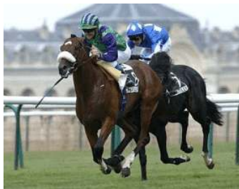
Turtle Bowl le-cheval-bleu.com