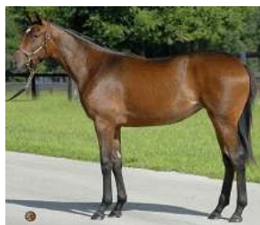
Hip 19