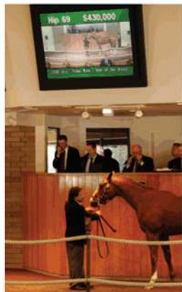
Tribal Star 2005 colt by Tribal Rule – Star of the Woods, by Woodman $60,000 Yearling (Hip 207) Sold for $430,000 in May (Hip 69)