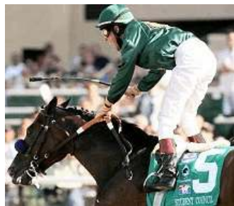
Student Council

His biggest previous performance was a victory in the Jan. 27 Maxxam Gold Cup at Sam Houston and he was