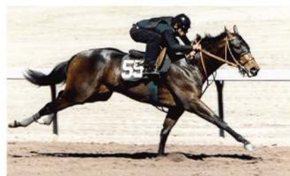
Native Code 2005 filly by Kafwain – Courtney Kathy, by Lost Code $115,000 Yearling (Hip 313) Sold for $185,000 in March (Hip 55)

Bases Loaded with Potential at Barretts this Fall!