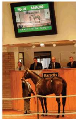
Charming Hostess 2005 filly by Cape Town – Charming Gal, by Slew's Royalty $240,000 Yearling (Hip 301) Sold for $800,000 in March (Hip 35)

High Rates of Return for 2006 October Sale Yearlings at Barretts 2007 March and May 2-year-old Sales.