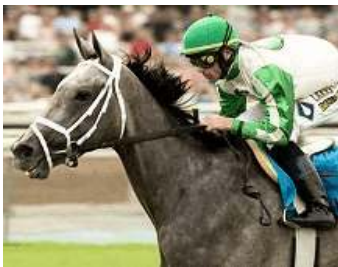
Wait a While

always shown affection for this race track and that's why we'd consider running her back on only about three weeks rest. She broke her maiden here and she seems to run well here every time." My Typhoon faces a stiff task, however, with a pair of fillies, Wait a While and Vacare, trying to get back to winning ways. Wait a While was brilliant on the sod in 2006, winning a pair of Grade I's and the GII Lake Placid S. over this course 12 months ago. But after winning the GIII Honey Fox H. at Gulfstream in March, she disappointed as the odds-on favorite in her next two, running fifth in the Jenny Wiley before failing to reel in My Typhoon, who was left alone through dawdling fractions, in the Just a Game. She's been working well for her return and should get some pace to run at. Vacare , meanwhile, counted the GI Queen Elizabeth Challenge Cup among her victories last year, but the four-year-old filly lost her unbeaten record when she was third to Citronnade in the GI Gamely S. at Hollywood May 28.