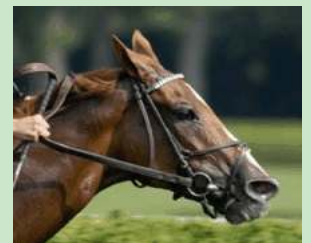
My Typhoon

BALLSTON SPA Last year's champion three-year-old filly Wait a While (Maria's Mon) and recent GI Diana S. heroine My Typhoon (Ire) (Giant's Causeway) are among those set to line up in a very deep renewal of the GII Ballston Spa S. at Saratoga this afternoon.