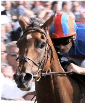
Peeping Fawn

Seconds after Peeping Fawn (Danehill) had crossed the line alone after the G1 Darley Yorkshire Oaks, odds of 4-9 looked generous for the latest phenomenon to