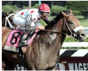
Most Distinguished

Most Distinguished enjoyed a break-out victory in the six-furlong GII Amsterdam S. over this strip July 30 and tries to keep the momentum going in this, arguably the most important three-year-old sprint race in the country. "He's a consistent horse that tries hard and is there every time," said trainer Nick Zito. "We got a good, solid race from him in the Amsterdam. Stretching out a little in distance is going to help him. This is always a great race. I'd love to win it."