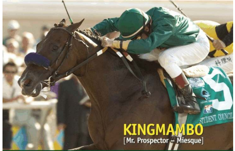
KINGMAMBO [Mr. Prospector - Miesque]