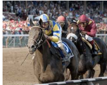
Street Sense in the Jim Dandy