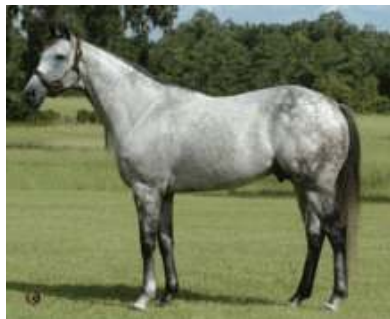
Macho Uno, sire of yesterday’s session topper adenastallions.com

‘MACHO’ MAN LEADS WAY AT OBS A colt from the second crop of GI Breeders’ Cup Juvenile winner Macho Uno (Holy Bull) stole the spotlight at yesterday’s second open session of the Ocala Breeders’ Sales Company’s August Yearling Sale in Ocala, Florida.