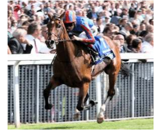
Peeping Fawn

Peeping Fawn's exploits in deep ground at The Curragh in both the June 30 Pretty Polly and July 15 Irish Oaks, and on Goodwood's quick surface in the Aug. 4 Nassau S. are well documented, and she is simply on a different plane to the best of her own sex at present. That didn't seem the likeliest scenario in her